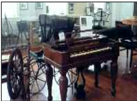
Awesome Mantua Artifacts to See!

The Mantua Township Museum, located in the Norris Street School Building, opened on June 12, 2010. This facility was originally used to educate students in Mantua Township until 1940. Over a hundred local Family Genealogies are available for review. Additionally, current and former residents can receive guidance in searching their family trees. Our Goal is to preserve the History of the Township, its Family's and artifacts for future Generations.