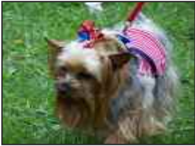
2010 "Bark in the Park" Dog Parade